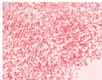
Healthy, untreated, oral mucosa cells.

Cell testing 2 in the oral mucosa has given the following results: